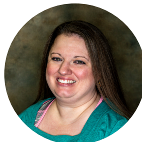
AMY SIMPSON WORK STUDY PHOTOGRAPHER